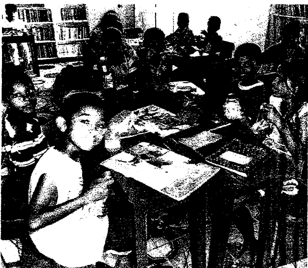
Enjoying snacks after class, provided by the Centre

There is always a need for funds to continue and expand the centre's work in providing for many more individuals in various communities. For more information on how you can help, visit goodhope-gy.org