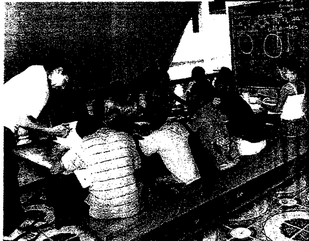
Students receiving help with Maths